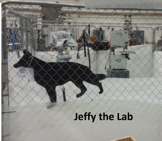
Jeffy the Lab