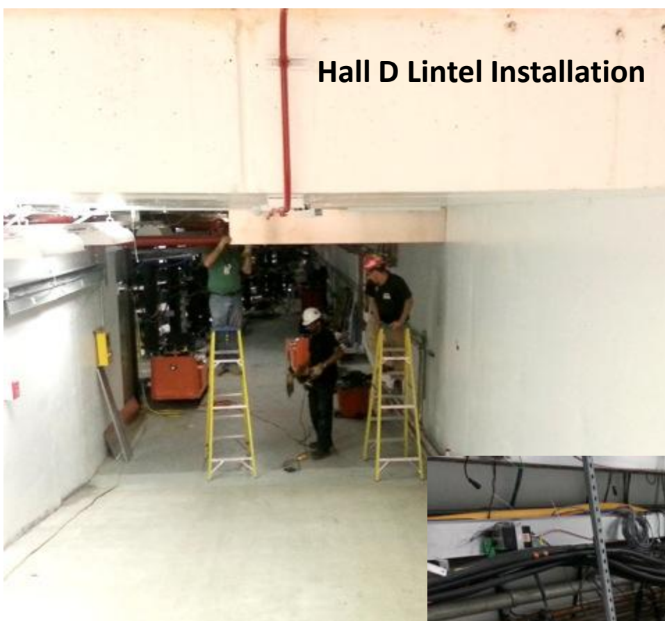
Hall D Lintel Installation